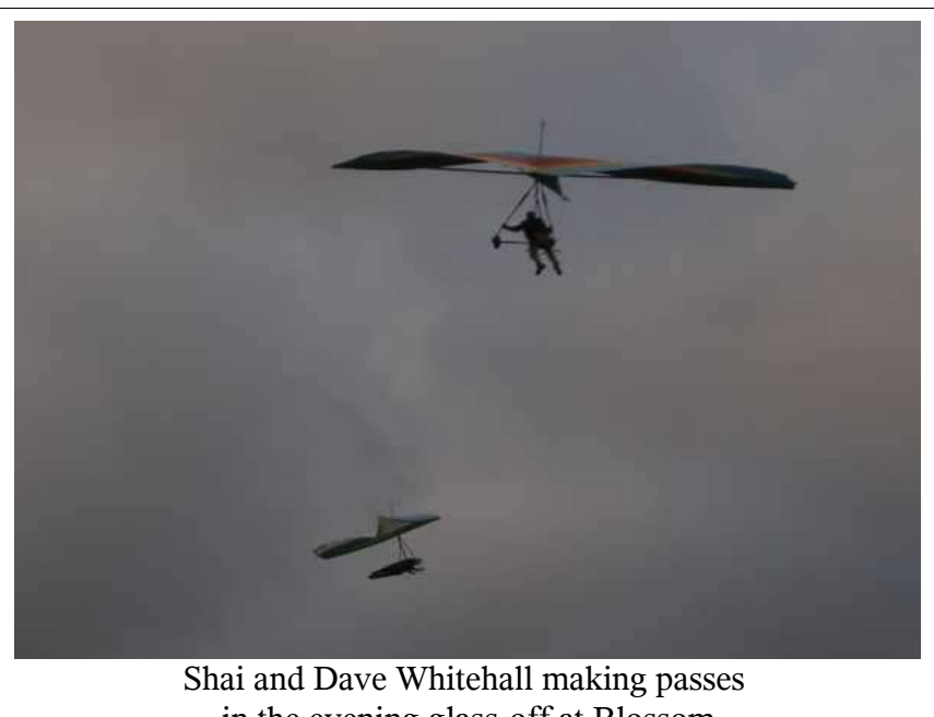
in the evening glass-off at Blossom

SP: I am a software architect for DivX, a digital video software company.